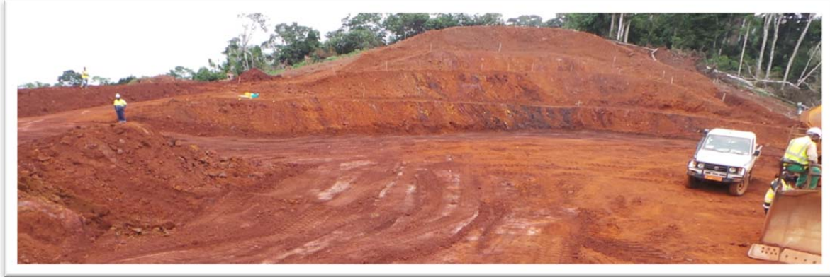
Initial Mining Benches at the Nabeba Deposit exposing Surficial Mineralization – view looking west

This exposure has allowed Sundance, Cam Iron and Congo Iron geologists and engineers to map and review the supergene mineralisation profile as compared to the modelling data and interpretation from resource definition drilling data. The mining has also permitted better bulk sampling and test work of rock density and natural moisture content.