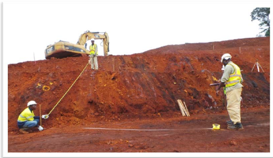
Geologists mapping and undertaking structural measurements in the Nabeba Pit

To date, only the top 10m of material has been exposed which is predominantly represented by the ‘Surficial’ Domain of mineralisation.