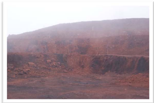
Nabeba Trial Mining – a similar exercise is scheduled to take place at the Mbarga mine site in September 2014. (Above & below images)

The responses were received during the Quarter and they reconfirm that there is an appetite in the market to take on this work and substantially validate the pricing used in the 2010 Definitive Feasibility Study.