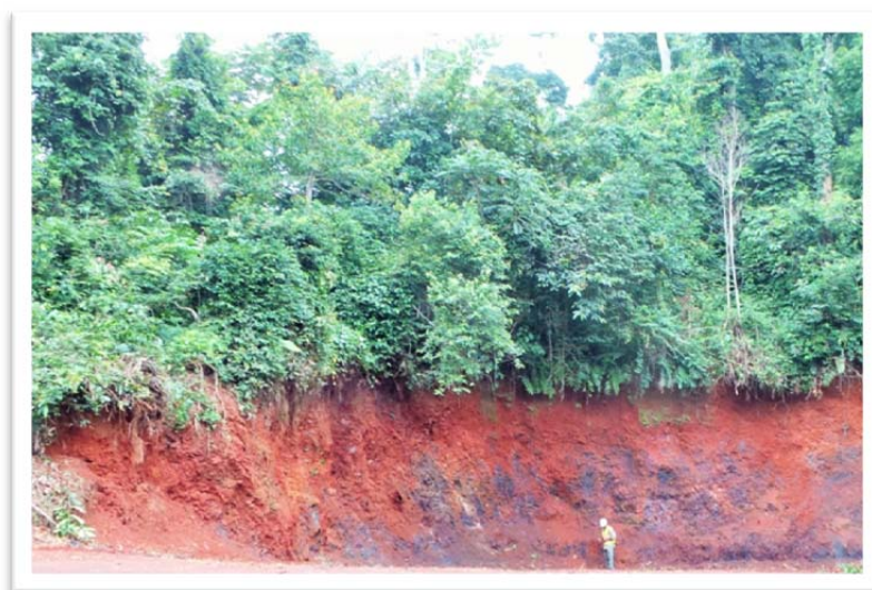
Geological mapping within EP92 in Cameroon

The company’s exploration geologists continue systematic mapping and evaluation of the satellite prospects and mineralization at all three of the Project Tenements in Cameroon and Congo.