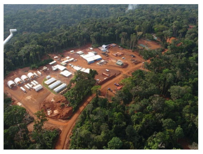
FIGURE 1: MBALAM PROJECT CAMP SITE IN CAMEROON

During the June Quarter more than 10,000m of drilling was completed on Site and Exploration operations were maintained continuously despite this being the wettest part of the year. This further demonstrates the sustainability of Sundance's field operations which are founded on first class camp and service facilities (Figure 1) backed by a highly experienced field team and professionally run corporate offices in both Yaounde and Brazzaville.