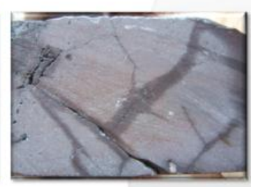
TABLE 1: SUMMARY OF INDICATED AND INFERRED RESOURCES OF HIGH GRADE HEMATITE; PHOTOS OF MBARGA DSO

While no work is currently being undertaken on the underlying Itabirite Resource, Sundance has previously drilled and defined a world-class Itabirite Hematite Resource at Mbarga, which at 2.32 billion tonnes at 38% Fe (Table 2), remains one of the highest grade mineralised deposits of this type in central-west Africa.