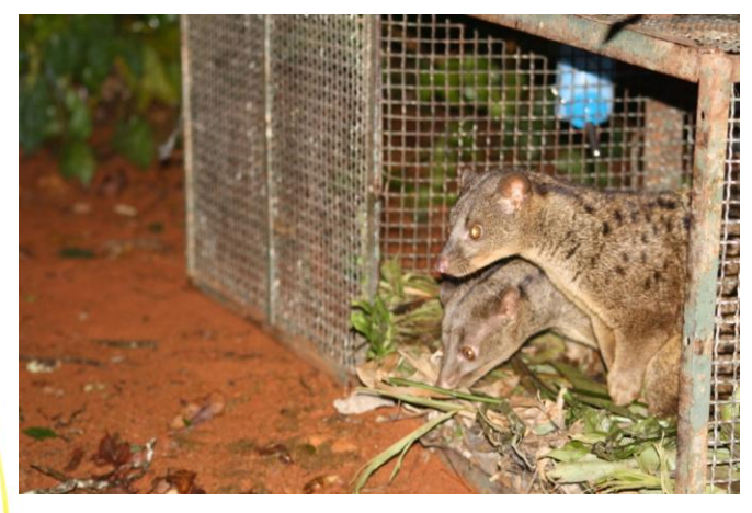
FIGURE 6: TWO GENETS BEING RELEASED IN THE WILD AT THE MBALAM SITE

A Genet is a nocturnal, catlike mammal found in Africa. The two Genets were orphans confiscated from poachers and were raised at the Mefou Primates Sanctuary for two years. They required a natural forest environment safe from hunting for them to be returned into the wild. Sundance's remote Mbarga mine site is protected from hunters and offers such an environment. Longer term, the programmes envisaged will aim at similarly releasing primates that are rescued from poachers and traffickers.