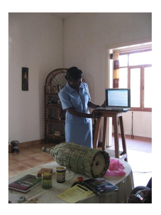
FIGURE 7: PRESENTATION BY GUIDING HOPE TO SUNDANCE ON THE HONEY CARAVAN PROJECT

Also during June 2011, negotiations progressed on formalising the Company's support of the Global Virus Initiative, which is an organisation in Cameroon working to prevent and predict the rise of diseases originating in the wildlife through education, monitoring and research.