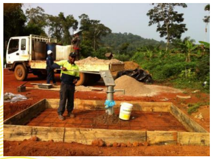
FIGURE 4: INSTALLATION OF COMMUNITY WATER BORES AT MBALAM VILLAGE

During the Quarter, the Company utilised one of its drill rigs to drill water bore holes in the Mbalam village as part of the Company's ongoing commitment to the local community. The water quality is currently being tested on all holes with the most suitable selected for manual pump installation. Installation of two hygienic manual water pumps at the Mbalam village was completed in May 2011 (Figure 4). Training, education and monitoring for the first bore installed in Mbalam is being organised, with a proposal to involve a Non-Government Organisation that specialises in water bores.