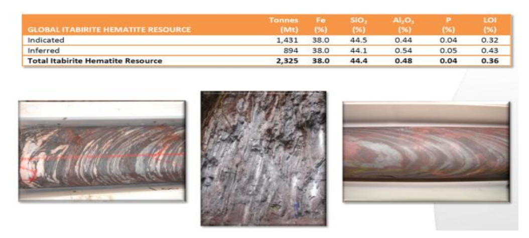
TABLE 2: SUMMARY OF INDICATED AND INFERRED RESOURCES OF ITABIRITE; PHOTOS OF MBARGA ITABIRITE

The estimate only includes Itabirite mineralisation at the Mbarga Deposit whereas there are strong indications from deeper drill holes at Nabeba, that a similar mineralised system directly underlies the high grade supergene-enriched cap.